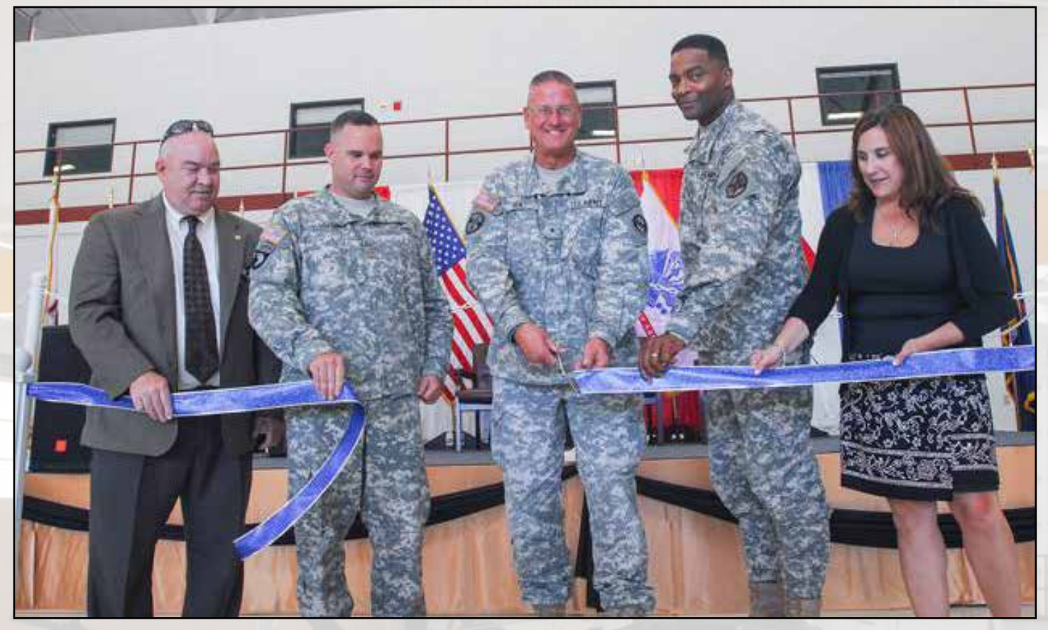
The Maryland National Guard officially recognized the expansion and renovation of the aviation facility with a ribbon-cutting ceremony, Sept. 25.

employees, employers, citizens and especially Americans, should forevermore dedicate ourselves to this example."