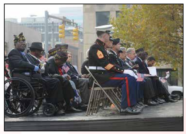
Members from all services and their Families came out to celebrate Veterans Day in downtown Baltimore.