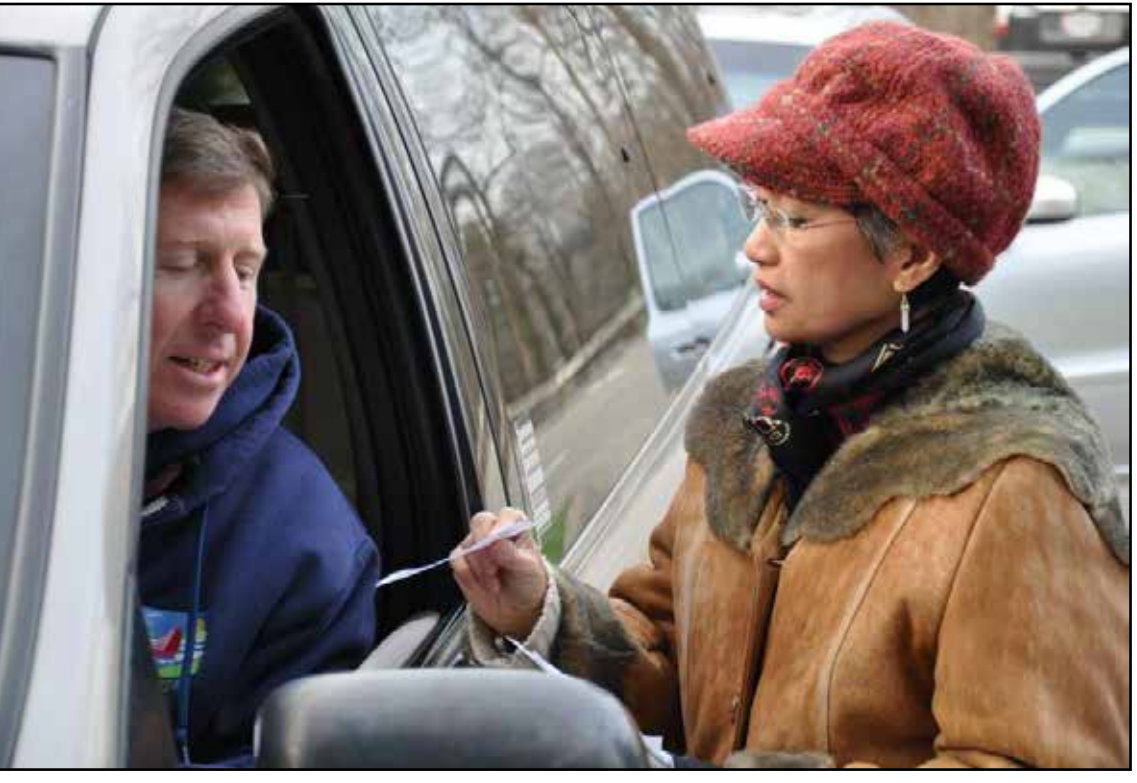
The giving of the holiday season was in full swing as a Maryland National Guard Partners in Care congregation donated food to needy families on Dec. 15, in Ellicott City, Md. Every Christmas, for more than 30 years, the members of the First Evangelical Lutheran Church have coordinated a food drive. This year, they identified 144 families in need. Twelve of them are from the Guard.

"They are taking the idea [of Partners in Care] and adapting it Line