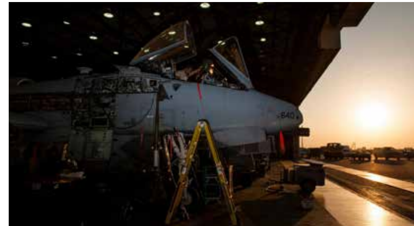
U.S. Air Force Staff Sgt. Edgar Castellano, 447th Expeditionary Aircraft Maintenance Squadron phase maintenance, relays information from the cockpit of an A-10 Thunderbolt II during a scheduled phase inspection Oct. 20, 2016, at Incirlik Air Base, Turkey. The A-10 Thunderbolt II received an inspection to ensure it remained fully operational.