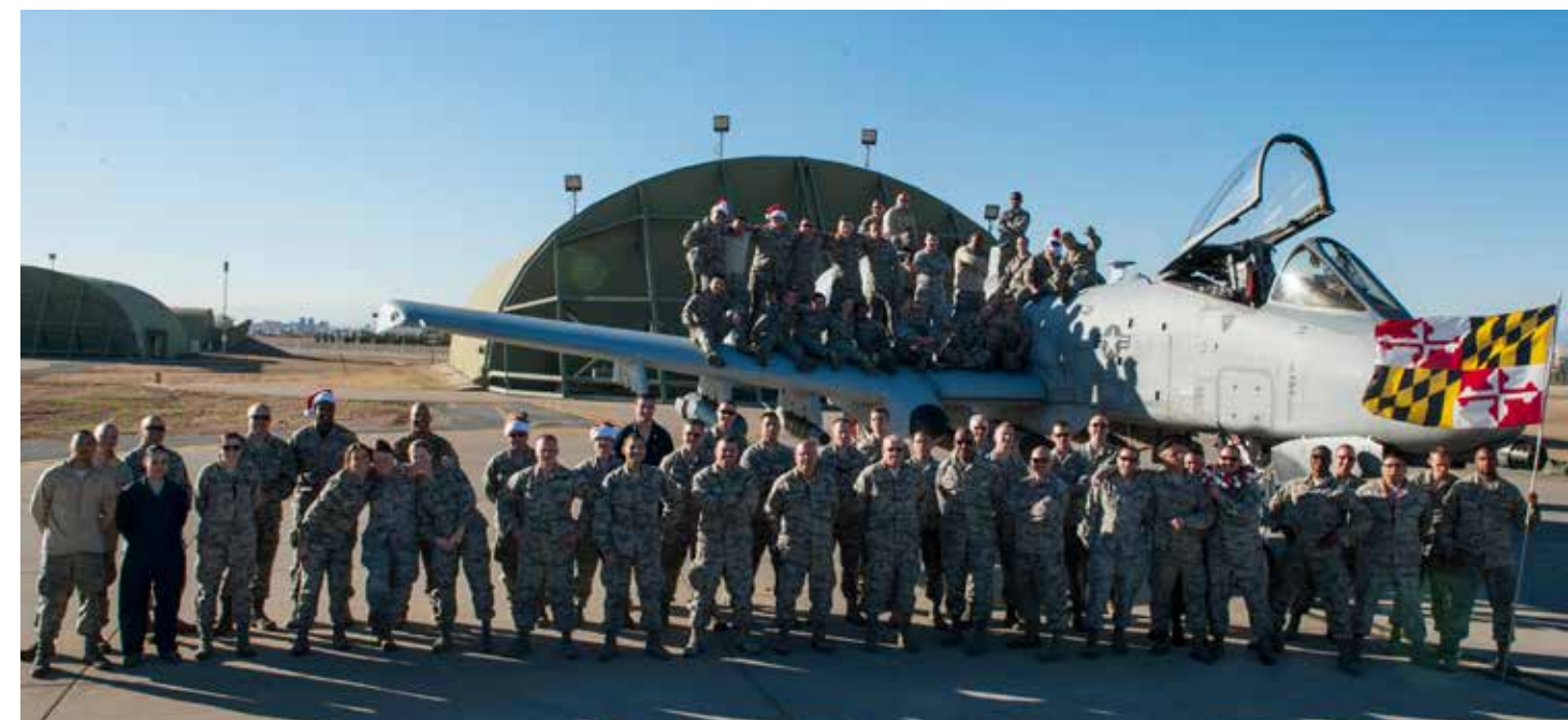
Members of the 104th Fighter Squadron take a break during flight operations in the Middle East to wish everyone back home a Merry Christmas and home a Happy New Year.