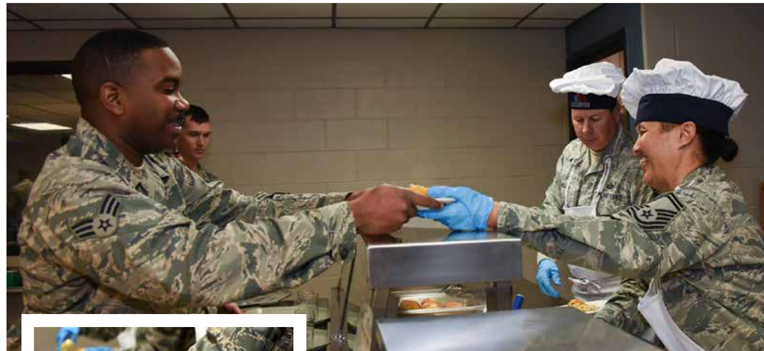
Thanksgiving lunch during drill Chief master sergeants and senior master sergeants serve Thanksgiving lunch during drill Nov. 5, 2016 at Warfield Air National Guard Base, Middle River, Md.