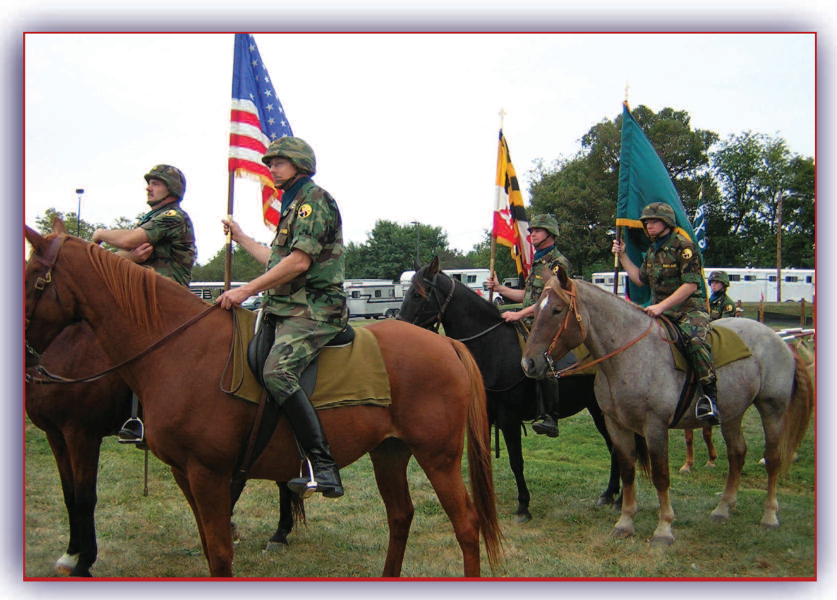
The Maryland Defense Force Color Guard and mounted Cavalry Troop prepare to post the colors.

MDDF will continue its efforts to reorganize and train to become the premier volunteer force in Maryland and set the standard for public service for other volunteer groups in Maryland.