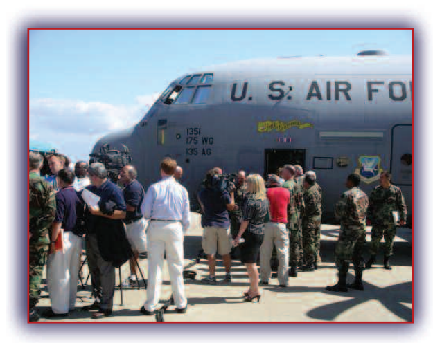
Members of the Maryland Defense Force and civilian volunteers from Maryland board a C-130J transport from the 135th Airlift Group of the Maryland Air National Guard headed for the Gulf region.