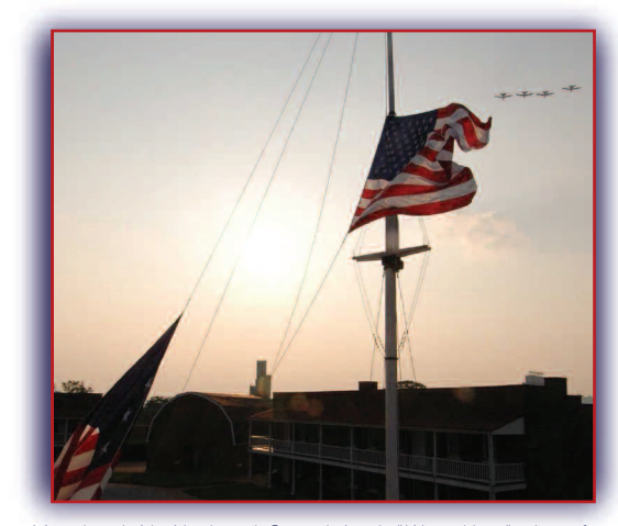
Four Maryland Air National Guard A-10 "Wart Hog" aircraft perform a flyover of Fort McHenry during the 191st Annual Defenders Celebration. The celebration commemorates the successful defense of Baltimore from British attack, the celebration of the citizen-soldier and the writing of "The Star-Spangled Banner." It also holds the title of being Baltimore's oldest holiday.