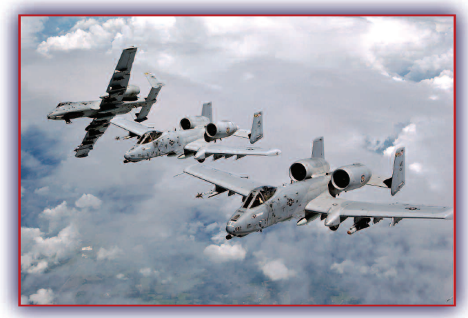
Three Maryland Air National Guard A-10 "Wart Hogs" fly in formation during a training exercise. The aircraft and crews from the 104th Fighter Squadron have been involved in supporting the Global War on Terror.