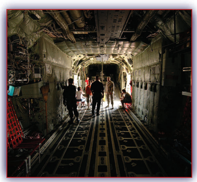
Loadmasters from the 175th Wing of the Maryland Air National Guard check their C130-J as they prepare for another humanitarian mission to the Gulf region during the recovery effort for Hurricane Katrina.