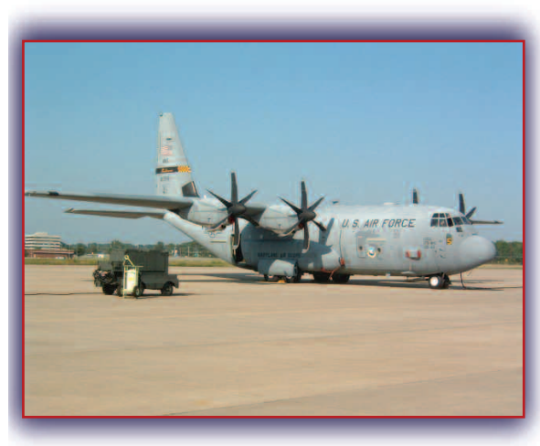
One of Maryland Air National Guard's C-130J "Hercules" aircraft sits on the flightline of Warfield Air National Guard Base in Middle River, Md. The aircraft was instrumental in delivering aid to the devastated people in Mississippi and Louisiana during Hurricane Katrina and Rita.