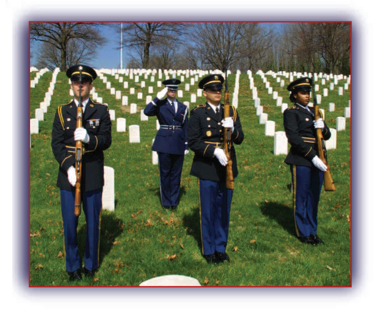
The Maryland National Guard Honor Guard renders a salute to a fallen veteran at Dulaney Valley Memorial Gardens.