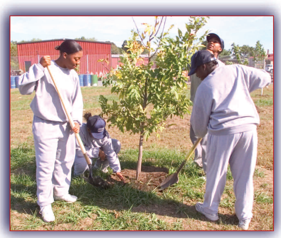
Four cadets enrolled in the Freestate ChalleNGe Academy plant a tree obtained through a grant from the Chesapeake Bay Trust at Havre de Grace Military Reservation. The cadets received instruction on how to properly plant trees from members of the Maryland Department of Natural Resources.

The Freestate ChalleNGe Academy is a 22-week residential intervention program for unemployed drugfree, "at risk" high school dropouts from Maryland and the District of Columbia. ChalleNGe is for young men and women who wish to make major changes in their lives and who are willing to take responsibility for making the changes happen. The students are mentored for an additional 12 months after they graduate from the program. The year 2005 has been a banner year for the academy by graduating 111 students in June.