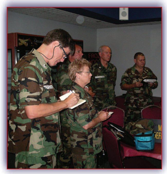
Volunteers for the Maryland Defense Force receive briefings before being deployed to help in the Hurricane Katrina recovery effort.