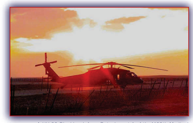
A UH-60 Blackhawk from Detachment 1 of the1159th Medical Company stands ready on the flight line in Iraq. The 1159th from Edgewood, Md. recently returned from Iraq where they supported Operation Iraqi Freedom.

The Military Department is requesting $48 million in federal military construction to build a Joint Forces Headquarters building in support of the Maryland National Guard realignment and mission. The headquarters would facilitate command and control of the Maryland Army and Air National Guard, the United States Property and Fiscal Office for Maryland and the Weapons of Mass Destruction Civil Support Team (WMD-CST).