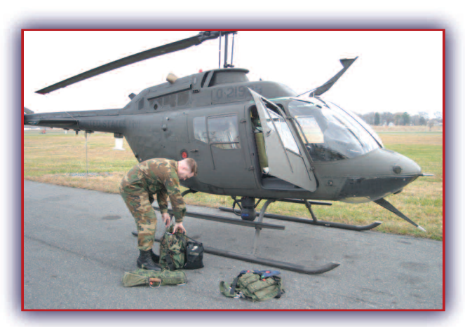
An aviator with the Maryland National Guard's Counterdrug Task Force goes through the preflight checklist on the flight line for a night mission in an OH58.