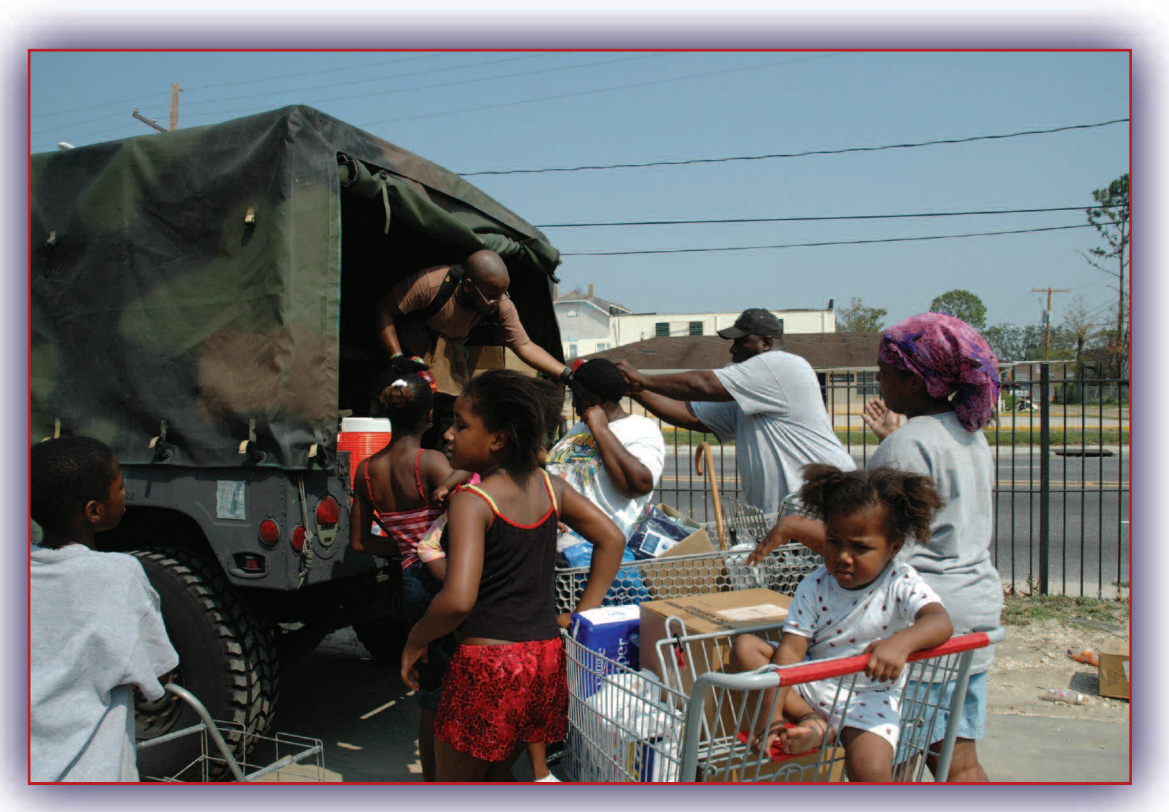
MEMA was the lead state agency for coordinating the Hurricane Katrina recovery effort for Maryland. This picture shows deployed soldiers from the Maryland Army National Guard handing out supplies to the citizens of Jefferson Parish.