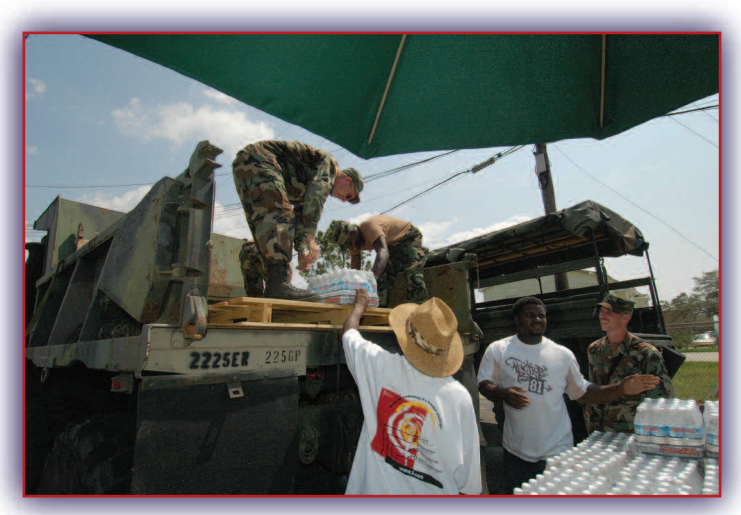
Soldiers from the Maryland Army National Guard unload water and supplies from a 2½ ton truck at an aid station in New Orleans in the wake of Hurricane Katrina.

The Maryland Defense Force revamped its medical teams into the 10th (Maryland) Medical Regiment as the new headquarters unit for the talented healthcare professionals that are part of the Force. The unit provided command and control for other Maryland healthcare practitioners deployed to Louisiana in the aftermath of Hurricane Katrina.