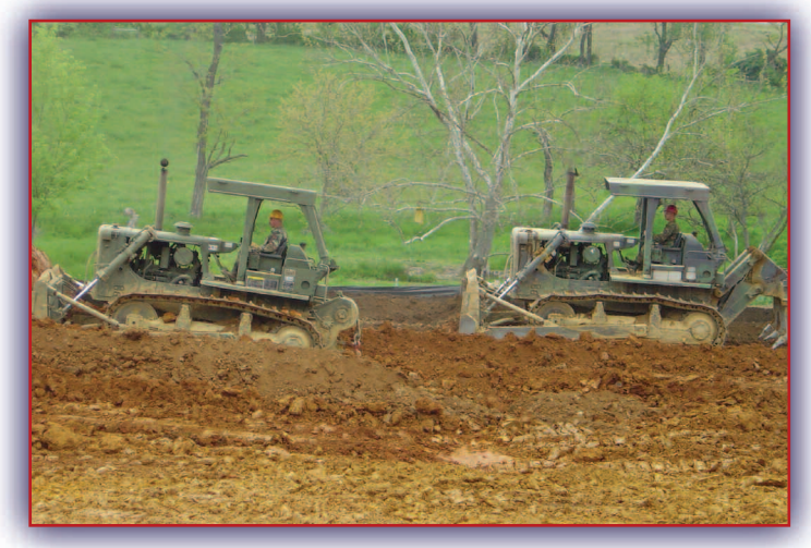
Two bulldozers from Company B, 121st Engineer Battalion work in tandem to clear the way for a new park and community center located in Boonsboro, Md. More than 50 soldiers from Company B, located in Cumberland, Md., spent their annual training getting the grounds ready for future park construction as part of the Innovative Readiness Training (IRT) program sponsored by the Defense Department.