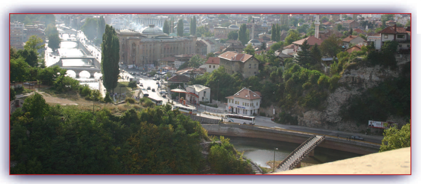
A view overlooking Sarajevo, Bosnia-Herzegovina

The Maryland Military Department is marking its twelfth anniversary of the State Partnership Program (SPP) with Estonia. The SPP was launched in Europe as part of the initial outreach by the United States to new democracies in Central and Eastern Europe and the former Soviet Union. The SPP brings together U.S. states and territories with partner nations through a range of military, civil-military and civilian activities under the Maryland Military Department auspices. Maryland also was selected to partner with Bosnia-Herzegovina in part because of the success with Estonia. Maryland has a key role in this international initiative to foster democracy, encourage market economies and promote regional cooperation and stability. The partnership program emphasizes civil and military cooperation with civil control of a professional military. Bosnia expressed an interest in learning how to recruit a volunteer force and implement an active reserve component model as well as a non-commissioned officer corps.