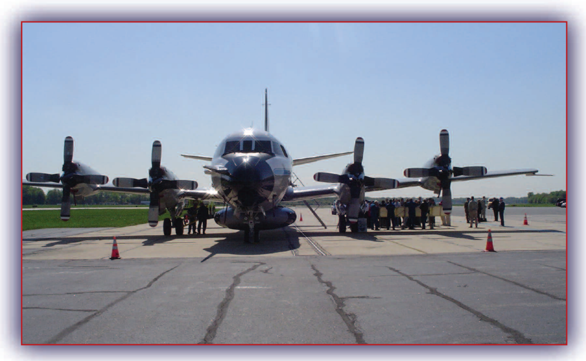
MEMA coordinated with NOAA for a demontstration at Martin State Airport of a Lockheed WP- 3D Orion "Hurricane Hunter." The data collected during hurricanes by this high-flying meteorological station is fed into numerical computer models to help forecasters predict how intense a hurricane will be, and when and where it will make landfall.