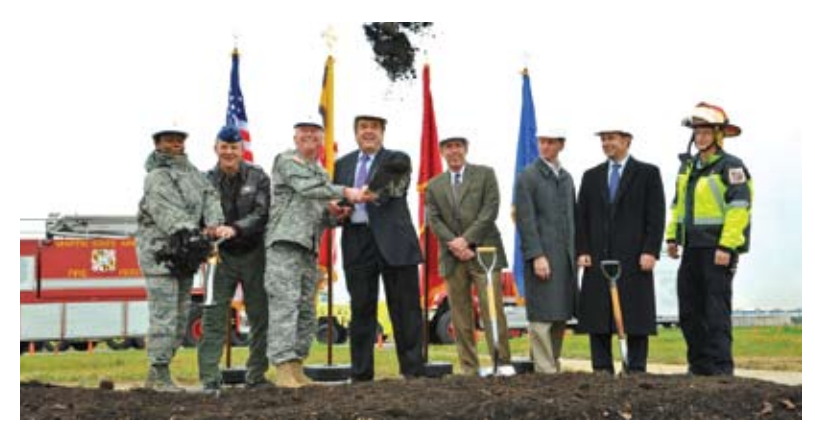
The Maryland National Guard broke ground on the Congress-appropriated $7.9 million fire station at the Warfield Air National Guard Base at Martin State Airport. The new state-of-the-art facility will house top notch training, office and storage facilities so Guardsmen can prepare for future missions.

The Maryland National Guard Honor Guard conducted their morning physical training, a unit flag football game, at the Baltimore Raven's M&T Bank Stadium.