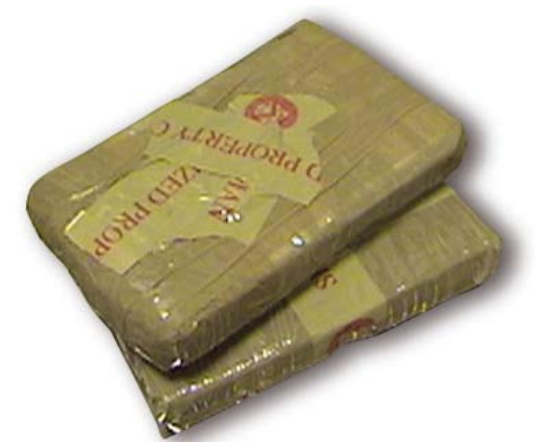
The Department of Homeland Security displays a recent seizure of a large amount of drugs that the Maryland National Guard Counterdrug Program assisted local law enforcement in removing from a neighborhood in Maryland.

Estimated number of students reached (FY09) 7,695