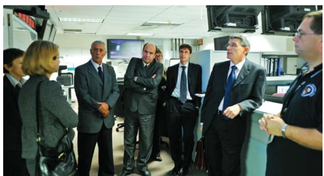
Members of the Bosnian parliamentary delegation conducted a variety of diplomatic visits as part of the Maryland National Guard's State Partnership Program. One visit was to the Maryland Emergency Management Agency.

was initially funded through a federal Regional Catastrophic Preparedness Grant from the U.S. Department of Homeland Security. Maryland is receiving $2.68 million for the effort.