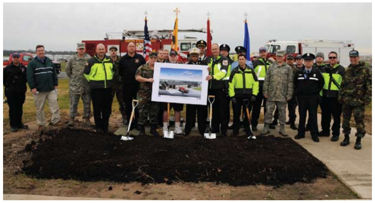
The Maryland Air National Guard prepares to break ground on their new, state-of-the-art fire station at Warfield Air National Guard Base.