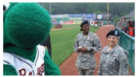
The Bowie Baysox hosted its annual "Army Night with the Baysox" to celebrate the 234th Army Birthday and the year of the Year of the Noncommissioned Officer. The Maryland Army National Guard honored the Year of the NCO by throwing out the ceremonial first pitch of the June 5 game against the Erie Seawolves.