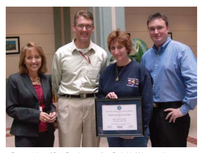
Representatives of State Farm Insurance from Frederick, Md., accept the Employer Support of the Guard and Reserve's "Above and Beyond" award. The award recognizes employers at the state and local level who have gone above and beyond the legal requirements for granting leave and providing support for military duty by their employees.

Employer Support for the Guard and Reserve is a Department of Defense organization. It was established in 1972 to promote cooperation and understanding between reserve component members (National Guard and Reserve) and their civilian employers and to assist in the resolution of conflicts arising from an employee's military commitment. They assist members from all seven reserve components; Army Reserve, Army National Guard; Air Force Reserve; Air National Guard; Navy Reserve; Marine Corps Reserve; and Coast Guard Reserve. They operate through a network of volunteers throughout the country, and the Maryland Office of the ESGR is located at the Headquarters of the Maryland Military Department in Baltimore.