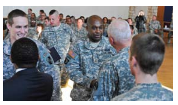
Approximately 30 Soldiers from the Maryland Army National Guard who deployed to both Iraq and Afghanistan were recognized during a Freedom Salute ceremony at American Legion Post 22 in Towson.