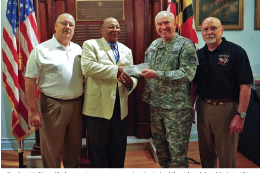
The Freestate ChalleNGe Academy is presented a check from the National Guard Association of the United States who presented three other checks from the funds left over from the NGAUS conference.