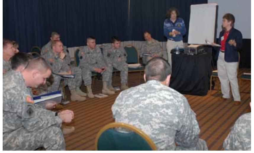
The majority of the instructors who support the reintegration training are volunteers. Two volunteers here work with members of the Maryland Army and Air National Guard.

The program establishes resources such as briefings by professional counselors, workshops, and faith-based and education seminars along with health screenings by MDDF health care professionals and other programs such as Partners in Care to achieve the goals of the initiative.