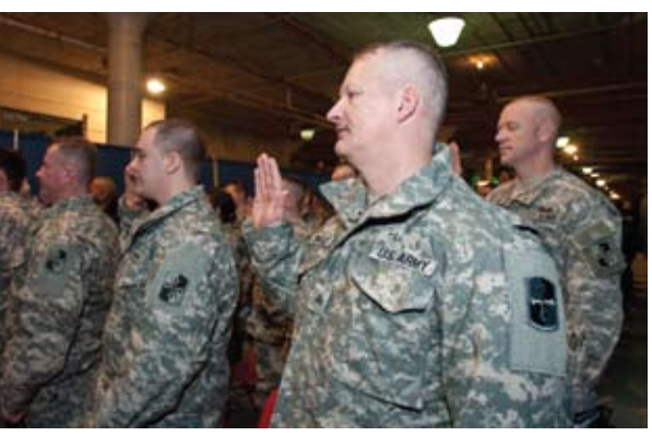
Members of Maryland Army National Guard's 175 Infantry Regiment based in Dundalk Md., are sworn in as Special Police after receiving a safety briefing at the D.C. Armory.

away as 50 miles from the plant. The exercise was graded by the Nuclear Regulatory Commission and the Federal Emergency Management Agency.