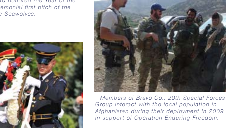
During a ceremony at Arlington National Cemetery in Arlington, Va., the Maryland National Guard paid tribute