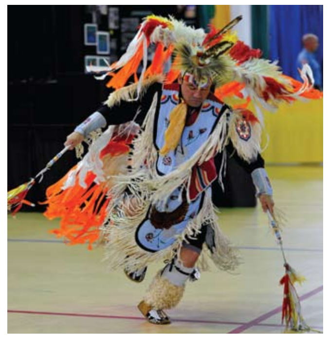
Unity Day is a combination of ethnic events designed to enhance cross-cultural awareness and promote harmony among all members of the Maryland National Guard. Unity Day included displays, artifacts and food samples from different cultures with more than 20 different ethnic/cultural booths.

Maryland's Emergency Operations Center activated in November of 2009 due to flooding caused by the remnants of Hurricane Ida. The MJOC manned the liaison officer position within the EOC to anticipate any needs required by the state.