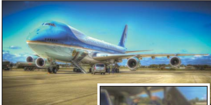
HDR or filtered images (detail shows "ghosting")

Panoramas (multiple shots stitched together)