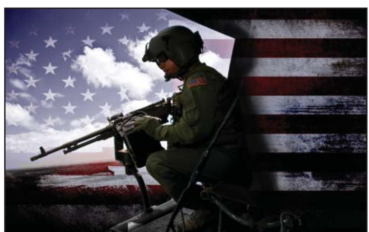
Superimposed images/changed backgrounds