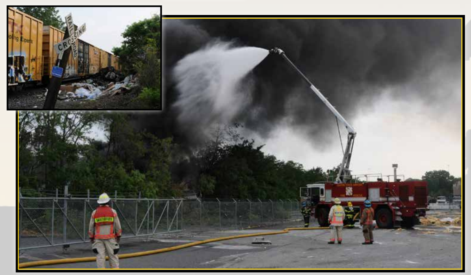
The Maryland Air Guard has a mutual aid agreement with Baltimore County to help during times of crisis. On May 28, 2013 the Maryland Air National Guard responded with high-flow pumper fire trucks and other vehicles for the train derailment at the Baltimore County/City line.

The combination of a trained aircrew flying a UH-60 Blackhawk with a helicopter bucket creates a rapidly deployable fire suppression system that can respond to calls across the entire state. The UH-60 helicopter bucket system holds 660 gallons of water and can be refilled from any open body of water.