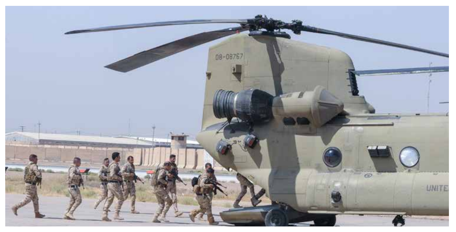
of partnered forces fighting ISIS. CJTF-OIR is the global Coalition to defeat ISIS in Iraq and Syria.