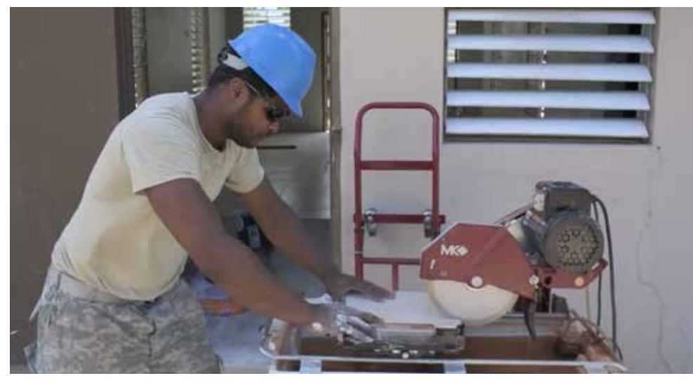
engineers, and mechanics.