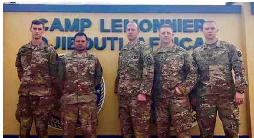
Soldiers from the Maryland National Guard's 110th Information Operations Battalion, pose at the entrance to Camp Lemonnier, Djibouti, following their official transfer of authority, Sept. 16. The Annapolis-based team, known as HOA 9, has deployed for the next nine months to support the Combined Joint Task Force – Horn of Africa (CJTF-HOA) and is responsible for integrating and synchronizing various information-related capabilities there.

In addition to its missions in support of CJTF-HOA, the 110th IO Bn. has also deployed teams to Afghanistan in support of Operation Enduring Freedom and is planning to support various other IO missions around the world in the coming months.