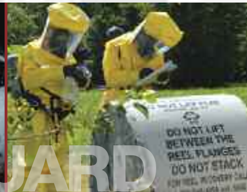
Members of the Maryland Air National Guard Air Force Emergency Management Team conduct preparedness training at Warfield Air National Guard Base.