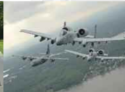
Two Maryland Air National Guard A-10Cs and a C-130J prowl the skies over Maryland on a training mission.