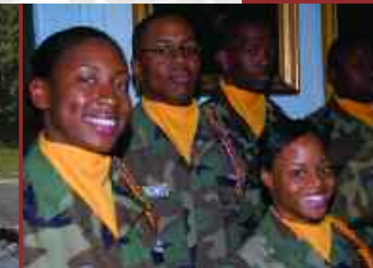
Maryland National Guard Challenge Academy cadets display their unit cohesiveness at an event at Aberdeen Proving Ground.