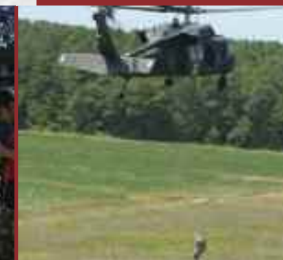
The Maryland Army and Air National Guard teams up for vital search and rescue training. During the training mission, Army Guard Black Hawk helicopters rescued downed pilots on the Eastern Shore while Air Guard A-10 Warthogs provided security.