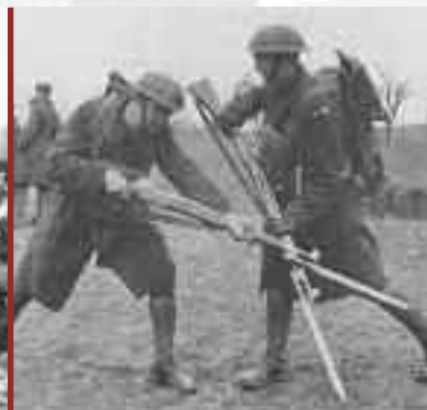
Members of the 115th Infantry Regiment train with bayonets in preparation for U.S. involvement in World War I.