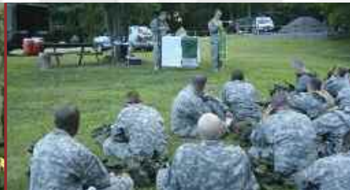
Chaplains from the Maryland Defense Force give mass to officer candidates at Camp Fretterd Military Reservation.