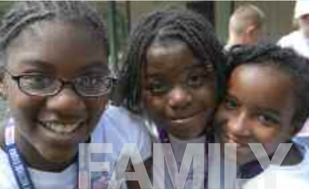
Campers from the Maryland Army National Guard Child and Youth Program, Homefront Challenge Camp, pose for a picture with their new friends as they prepare for the closing ceremony.