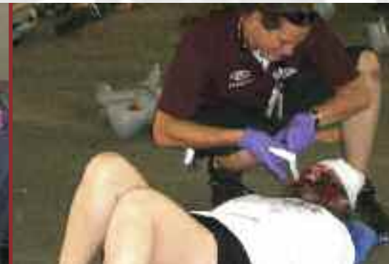
An EMT treats a simulated burn victim during Exercise Purple Haze at the M&T Bank Stadium in Baltimore on August 2, 2008.