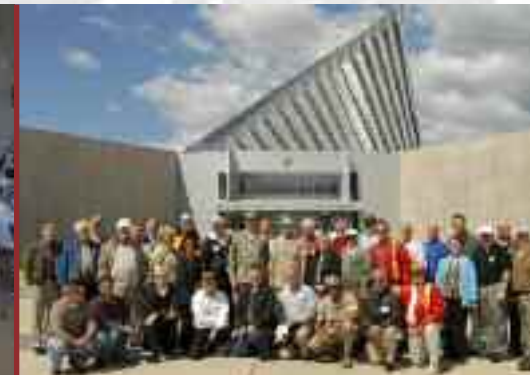
Employer Support for the Guard and Reserve Bosslift participants pose in front of the National Museum of the Marine Corps in Quantico, Va.