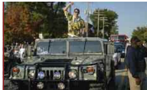
Olympic Gold Medalist Michael Phelps gets a ride in the Maryland National Guard "Minuteman" Humvee during a welcome home parade for the hometown hero.