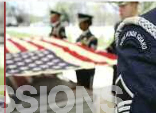
Maryland National Guard Honor Guard members place the American flag over the casket of a veteran at a burial ceremony.