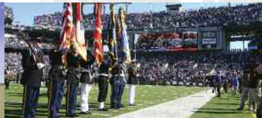
Members of the 224th Area Support Medical Company appear on the Raven's SmartVision screen at M&T Bank Stadium from Tallil Air Base in Iraq before the Ravens' win over the Oakland Raiders on October 26, 2008.