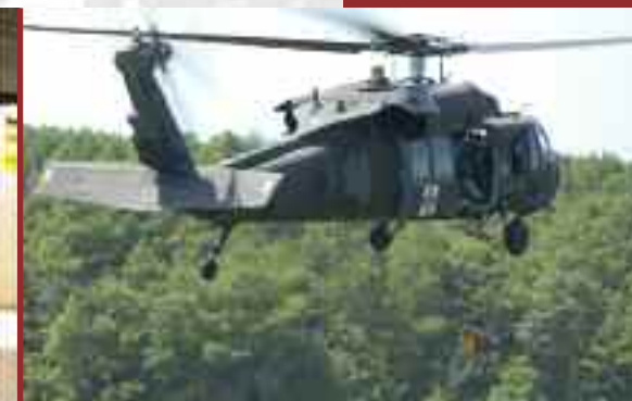
The Maryland Army and Air National Guard teamed up together for vital search and rescue training. During a planned scenario the MDARNG flew out Black Hawk helicopters to rescue downed pilots on the Eastern Shore. While Soldiers hoisted the downed pilots to safety, pilots from the MDANG provided security in their A-10 Warthogs.