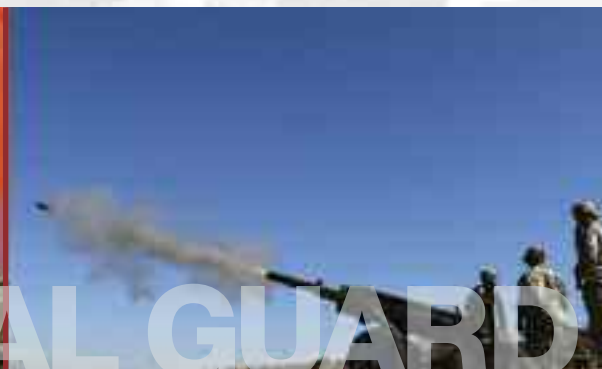
Soldiers from B Battery, 2nd Battalion, 110th Field Artillery Regiment fire the M102 105mm howitzer during the last live fire of the unit's guns at Fort A.P. Hill, Va., Saturday, Nov. 1, 2008. The regiment, organized in 1915 and now part of the 58th Infantry Brigade Combat Team, is scheduled to be inactivated in 2009 when the 58th IBCT transitions to a battlefield surveillance brigade.