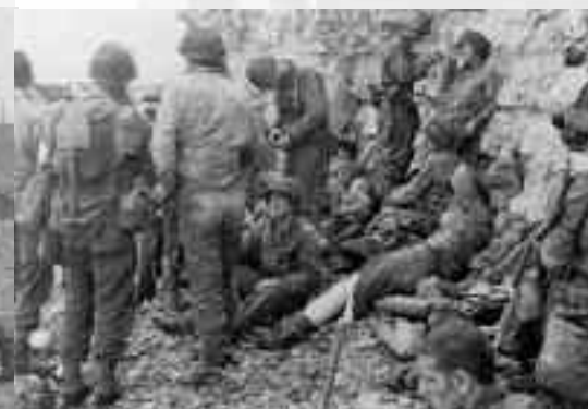
The Maryland National Guard's 29th Infantry Division at Omaha Beach on D-Day, June 6, 1944.