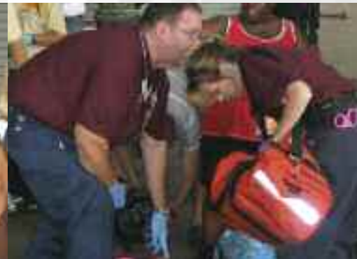
Emergency Medical Technicians evacuate casualties during the simulated mass casualty Exercise Purple Haze at the M&T Bank Stadium in Baltimore on August 2, 2008.