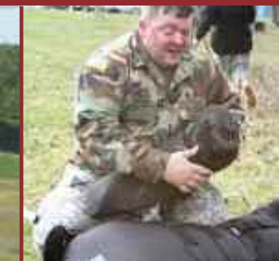
As part of non lethal weapons training, a Soldier from the 729th BSB takes down a simulated rioter while fighting the effects of pepper spray at Camp Fretterd Military Reservation in March 2008.