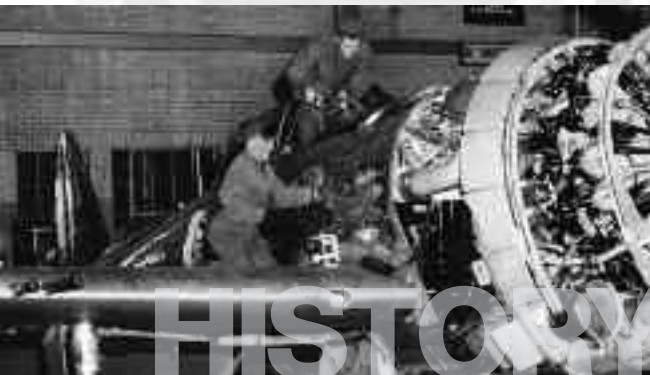
Members of the 104th Fighter Squadron perform maintenance of a P-47 fighter at Harbor Field in Baltimore, Maryland.