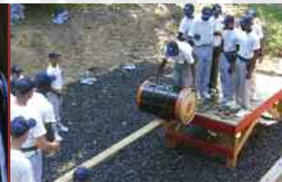
Maryland National Guard Challenge Academy cadets participate in a team building exercise during their 22-week program.