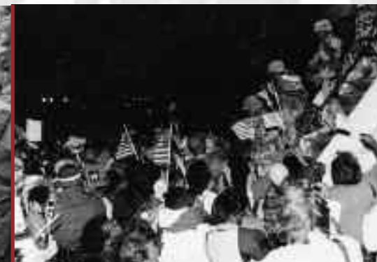
Maryland Army National Guard Soldiers return home from Operation Desert Storm in 1991.