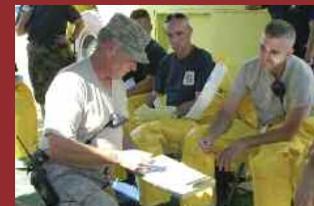
Air National Guard firefighters discuss their training mission at Warfield Air National Guard Base in Middle River, Md.