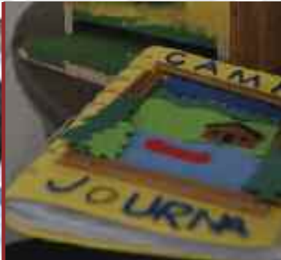
One of the many crafts and projects the Homefront Challenge campers made during the five-day camp.