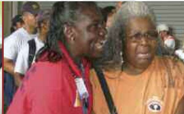
Actors simulate reactions to a mass casualty disaster during Exercise Purple Haze at the M&T Bank Stadium in Baltimore on August 2, 2008.