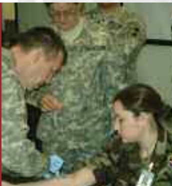
Maryland Defense Force medics oversee a student giving a saline lock while conducting combat lifesaver training.