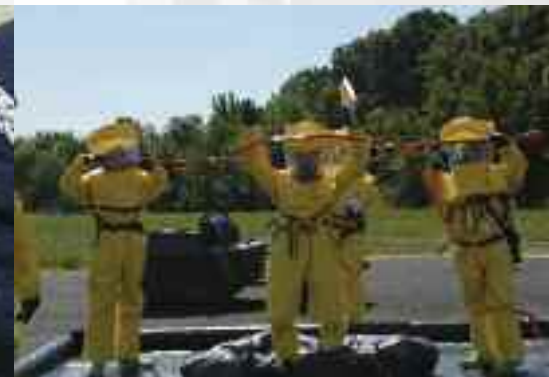
Maryland Air National Guard firefighters train for mission involving chemical environments.