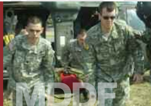
MDDF Maryland Defense Force medics simulate a casualty evacuation during a training mission.