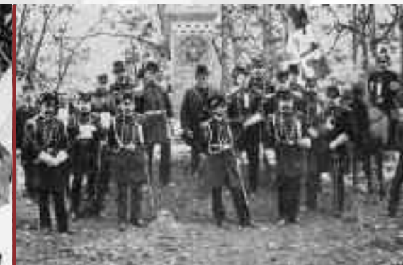
Maryland veterans of the Civil War gather for a reunion at Gettysburg in 1888. The current Maryland state flag was adopted from the one shown in the photo, which was carried by the 5th Regiment of the Maryland National Guard.