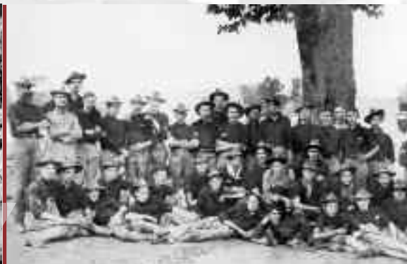
Members of Co. K, 5th MD Infantry, at Mt. Gretna in 1906.