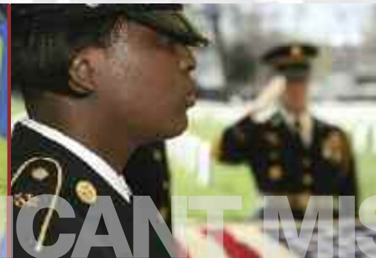
A member of the Maryland National Guard Honor Guard stands at attention during a ceremony for a deceased veteran.