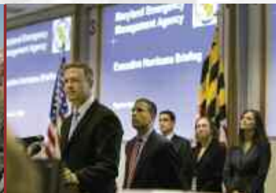
Governor Martin O'Malley addresses MEMA personnel during Tropical Storm Hanna.