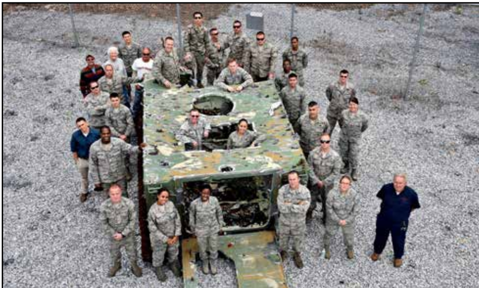
Members of the Maryland Air National Guard pose for a group photo after an A-10 live-fire exercise at Fort Indiantown Gap.