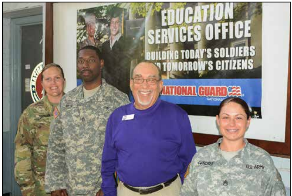
The Maryland National Guard Education service's team poses in front of the MDNG Education Service Office banner at the 5th Regiment Armory in Baltimore, Md.

Note: All schools 50 percent off tuition unless otherwise noted.