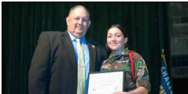
Friends and family greeted cadets of Class #44 of the Maryland National Guard Freestate Challenge Academy with tearful embraces after the completion ceremony at Aberdeen Proving Ground, Maryland, June 13, 2015. The completion ceremony celebrated the end of FCA's 22-week program to prepare at-risk teens for the GED certification exam.

The FCA was able to procure a $50,000 grant from the Edna McConnell Clark Foundation. This grant helped to establish a computer lab and purchased teaching and study materials for the cadets to prepare for and pass the new GED test. The GED test was upgraded from a 9th-grade level comprehension test to a college-entrance level test in 2014. This change made it difficult for cadets in Challenge programs throughout the U.S. to pass the test and receive their high school equivalent diploma. Receiving this grant allowed FCA to purchase the necessary materials to teach and train the cadets in preparation for their GED test. The results have shown an increase in the number of cadets who are now passing the GED test, thus receiving their Maryland High School diploma. Another key accomplishment is that the FCA's