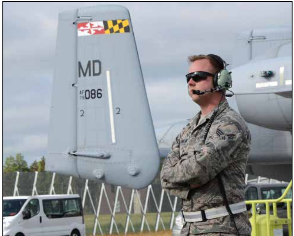
A crew chief assigned to the 175th Aircraft Maintenance Squadron, Maryland Air National Guard, waits for the preflight inspection on an A-10C Thunderbolt II aircraft during Sabre Strike 15, Amari Air Base, Estonia, June 8, 2015.

The cyber and intelligence units of the 175th Wing continued to solidify their mission: Site Action Task Force was completed in August 2015. The