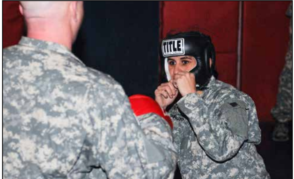
Members of the Maryland Army National Guard conducted Basic Combatives Level 1 training at the Edgewood Area of Aberdeen Proving Ground, Md., Dec. 8-11.

The 629th Military Intelligence Battalion achieved a 71 percent fill of personnel with 60 percent DMOSQ within six months of conversion. Fill and DMOSQ rate was more than nine months ahead of schedule, with C3 rating targeted for 3rd quarter of fiscal year 2018 a year ahead of 4-year timeline approved by Department of the Army. Army units reporting C3 or