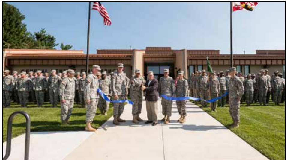
The Maryland Army National Guard hosted a ribbon cutting ceremony officially opening the MG Henry C. Evans Readiness Center in Westminster, Md. on Aug. 1, 2015. The readiness center opened at its current 10-acre Hahn Road location in 1980, replacing the older World War I era armory on Longwell Avenue. The renovated and expanded 33-year-old facility includes 16,019 square feet of new space. The readiness center is home to the 29th Military Police Company, 115th Military Police Battalion, and serves as a recruiting station for Carroll County.

Federal support to the Maryland Military Department is significant, as shown on the subsequent pages. These expenditures, which have an economic impact on nearly all political subdivisions in Maryland, cover pay and allowances, training, supplies, equipment, and construction. This also includes funding for the Maryland Emergency Management Agency by the Department of Homeland Security. The figures on pg. 8 for the counties without armories represent the salaries paid to Guardmembers who live in these political subdivisions but serve elsewhere.