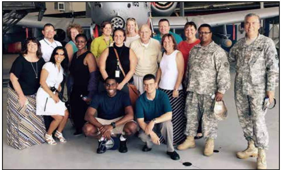
After touring the hangar, the Maryland National Guard Family Programs Team pose in front of an aircraft at the 175th Wing in Middle River.

MDNG children. It also provided 148 resource and referral contacts. The Maryland National Guard Child & Youth Program continued to focus on sustaining the 64 volunteers who provided 353 hours of volunteer work. Some activity highlights were the annual Drop & Shop event, the Christmas Tree Giveaway, the Summer and Spring Day Camps, and two Healthy Family weekends.