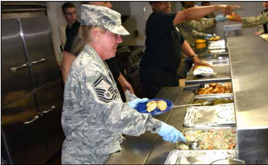
Maryland Air National Guard members serve dinner at Warfield Air National Guard Base in Baltimore on May 1, 2015, in support of Operation Baltimore Rally.