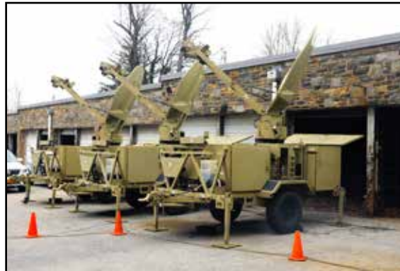
The Maryland Army National Guard's Company C (Signal) of the 29th Infantry Division was the first unit in the Army to field and train on the latest tactical network at the Military Reservation in Pikesville Md., Jan. 14, 2015.