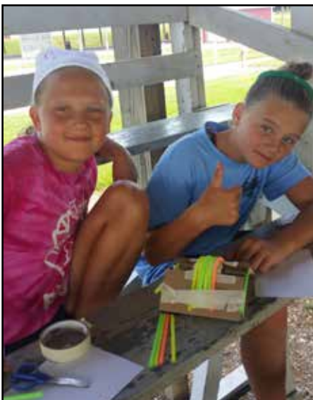
The Maryland National Guard's Child & Youth Program collaborated with the Washington County 4-H youth during a summer day camp at the Washington County Agricultural Center in Hagerstown, Md.

The Family Readiness Groups, guided by the unit commanders and FRSAs, reported a total of 1,332 volunteer hours, a 156% increase