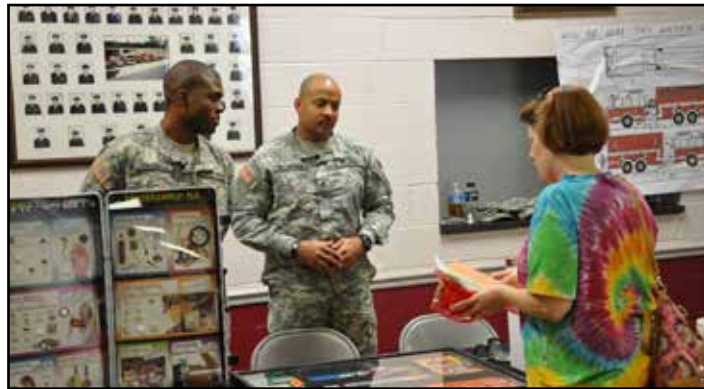
Drug abuse and violence are major concerns for every community as members of the Maryland National Guard Counterdrug Task Force support the Drug Awareness Expo in Union Bridge, Md., on Oct. 8, 2015.

Since 1989, the Maryland National Guard Counterdrug Program, a federally funded Department of Defense program, has been a vital member of a coalition of law enforcement agencies, community-based organizations, and educators. This coalition has been involved in a multi-front struggle against drugs and the violence and crime that drugs bring to our community. The mission of the program is to provide professional and dedicated military personnel with unique qualities to support federal, state, and local law enforcement agencies, as well as community-based organizations in efforts to reduce the demand for drugs in our state.