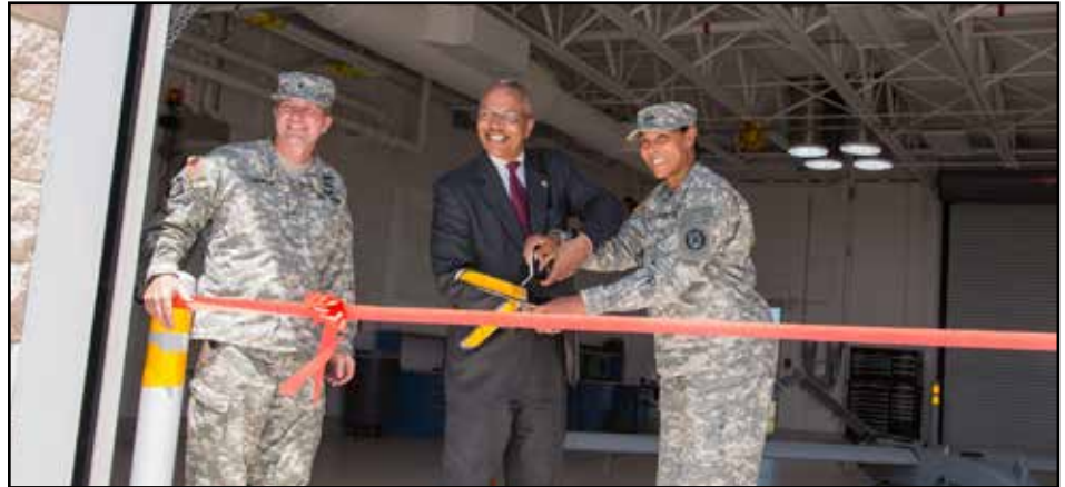
The Maryland Army National Guard hosted a ribbon cutting ceremony officially opening the Tactical Unmanned Aircraft System Operation Building on May 14, 2015, at Webster Field in St. Inigoes, Md. Construction began in 2011 and was completed in December 2014.

During this same period, the Maryland Air National Guard saw considerable turbulence in the number and type of aircraft flown at its air base in Middle River, and opened a new era in national defense with the activation of a cyber-warfare squadron. The staff of the Maryland Emergency Management Agency (MEMA) doubled in size, reflecting increased emphasis on an all hazards approach to emergency management, and the need for ongoing training and preparations to support well-coordinated, interagency response to a broad range of emergencies.