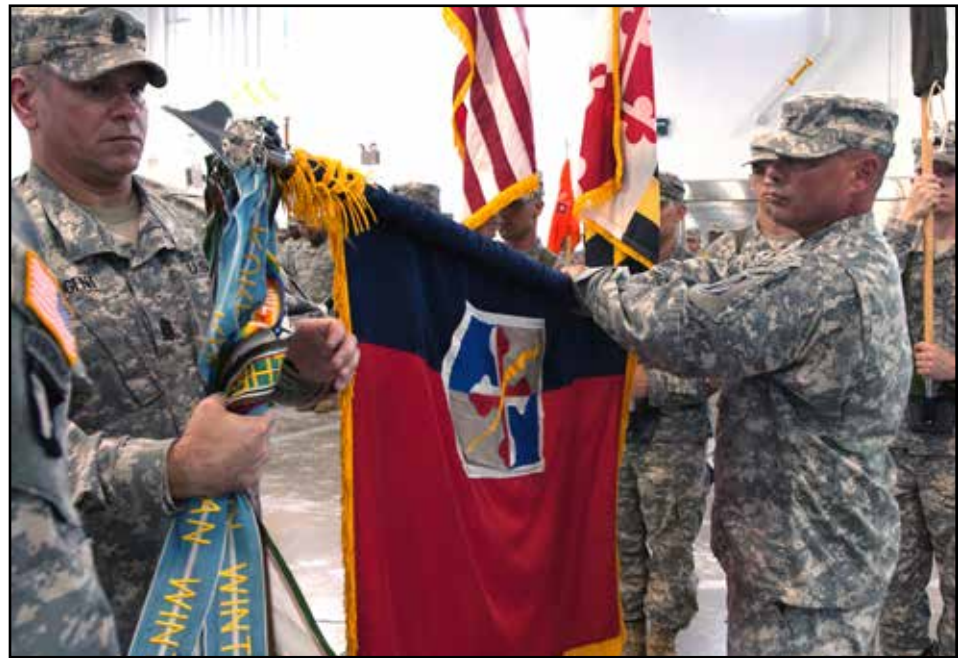
The Maryland Army National Guard’s 58th Battlefield Surveillance Brigade cases its colors and is replaced by the 58th Expeditionary Military Intelligence Brigade. The casing colors and the 58th EMIB change of command ceremony took place at Camp Fretterd Military Reservation near Reisterstown, Md., on Aug. 1, 2015.

The organization’s priorities continue to evolve in order to address changes in both foreign and domestic missions, force structure, and responsibilities of the Military Department. With these evolutions, improvements to facilities and infrastructure need to keep pace to ensure there is a proper platform from which duties can be performed in support of these priorities. Building upon the momentum and progress realized from the department’s Capital Investment Strategy, initially submitted in 2011, the Military Department published an updated Facilities Master Plan in May 2015 that provides a systematic, multi-year approach for all departmental components to address facilities shortcomings. This plan includes a mix of new construction, targeted restoration and modernization, effective sustainment, unit re-stationing, and facility disposals. Construction focuses on building more cost effective and