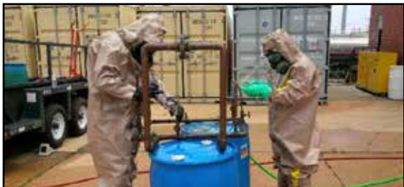
Service members from the Maryland National Guard's 32nd Civil Support Team collaborated with members of the Bosnia and Herzegovina CBRN Defense Company during their June 5-19, 2015, training.

The 32nd Civil Support Team (Weapons of Mass Destruction) is a highly specialized unit, which supports civil authorities by responding to situations involving the use of weapons of mass destruction or other incidents. The CST's mission is to assess the incident consequences, identify chemical, biological or radiological sources or agents, advise civilian responders on appropriate actions through on-site testing and expert consultation and facilitate the arrival of additional state and federal military forces and responders. The unit is composed of 22 full-time members of the Maryland National Guard, and their skills encompass 14 specialized career fields.