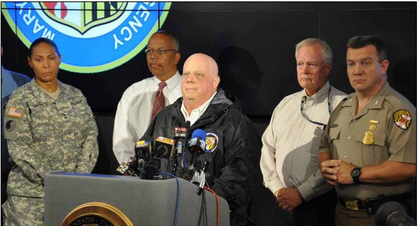
At the state emergency operations center in Reisterstown, Md., Governor Larry Hogan declared a state of emergency in Maryland as a precautionary measure for potential flooding and high winds as a result of Hurricane Joaquin. MEMA coordinated the state's response and Maryland Army National Guard prepositioned two Humvees to help with potential evacuations.

community Comprehensive Emergency Management Program that is interoperable across all mission areas of prevention, protection, mitigation, response, and recovery.