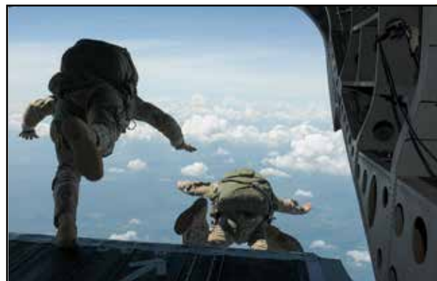
Maryland Army National Guard soldiers freefall from 13,000 feet during a jump with C Company (long-range surveillance), 1st Squadron, 158th Cavalry Regiment, on July 18, 2015, over Little Orleans, Maryland. The LRS unit, which is based out of Hagerstown, is scheduled to be disbanded in August. This was the LRS unit's last jump.