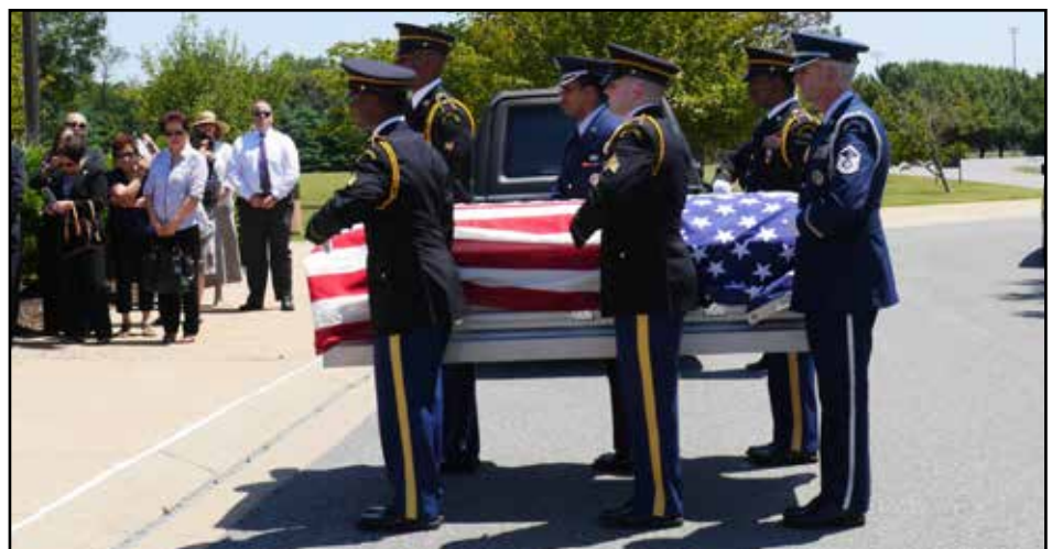
The Maryland National Guard Honor Guard carries a casket of a fallen warrior at the Crownsville Veterans Cemetery in Crownsville, Md.