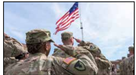
The Maryland National Guard officially welcomes home approximately 100 members of the 1100th Theater Aviation Sustainment Maintenance Group from their deployment during a Freedom Salute Ceremony at Fort McHenry, in Baltimore, Md on Aug. 23, 2015,

Phase 4: The reintegration phase consists of three parts. The first event occurs approximately 30-40 days after the unit returns home. It is for soldiers and airmen and their families. This event is held at a local hotel, and attendees are taught reconnecting with their family and children, single soldier issues and female service member issues. Other classes include Department of Veterans Affairs benefits, employment, resilience, finance, interacting with law enforcement, and post traumatic stress