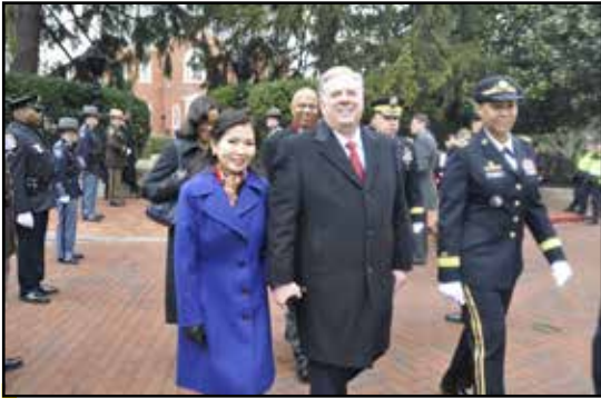
The Maryland Military Department took lead in planning and coordinating various events for the Gubernatorial Inauguration at the State House in Annapolis Jan. 21, 2015.