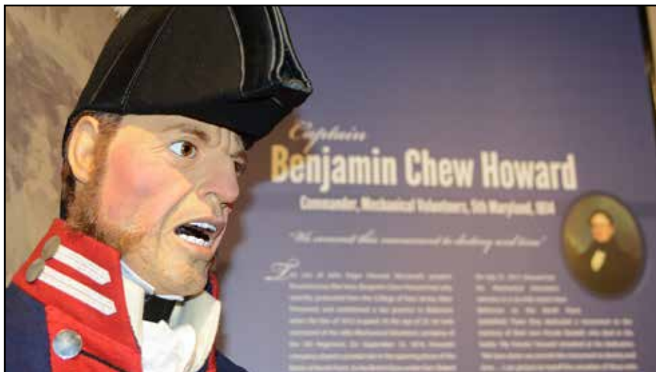
A mannequin of Benjamin Chew Howard stands in the 1812 museum display representing the War of 1812, "When Free Men Shall Stand," at 5th Regiment Armory in Baltimore, Md.

In 2015, the Maryland Military Historical Society continued its wide range of educational programs to complement its exhibitions. This