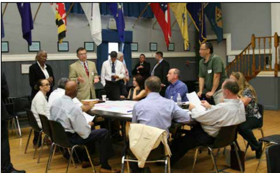
The Maryland Emergency Management Agency hosted an exercise for Maryland businesses where they proceeded through a disaster scenario and discussed methods to increase coordination between the public and private sectors and augment business continuity by identifying ways that Maryland government can support businesses during disasters.

The governor can count on National Guard assets to be available to him within the first hours of a domestic incident.