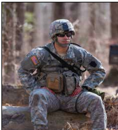
A Maryland Army National Guard member takes a rest before completes a task in the 2015 Best Warrior Competition at the Lauderick Creek Training Site in the Edgewood area of Md., March 14, 2015.

value to our soldiers and our communities.