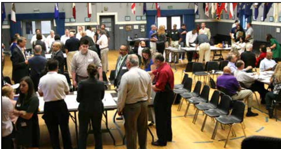
The Maryland Emergency Management Agency hosted an exercise for Maryland businesses where they proceeded through a disaster scenario and discussed methods to increase coordination between the public and private sectors and augment business continuity by identifying ways that Maryland government can support businesses during disasters.

MEMA's objective initiative is to strengthen a statewide, whole-