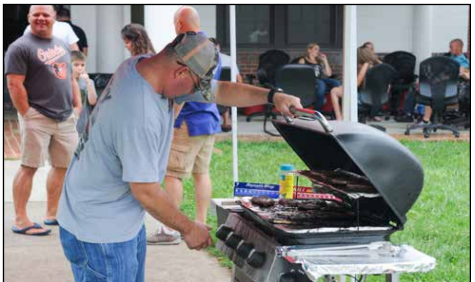
Starting off the holiday weekend, The Maryland National Guard's Recruiting & Retention Battalion, held their annual organization day at Camp Frettered Military Reservation in Reisterstown, Md., July 1, 2015. The event was held to bring soldiers and their families together, engage in activities, and to boost morale.

2015, the Teen Council participated in a Youth Symposium and three leadership trainings. This past year, the Maryland National Guard hosted its tenth-annual HOMEFRONT Challenge Camp for children and youth who have a parent in the Maryland National Guard. The camp was comprised of 56 campers, ages 7-12, who participated in a five-day residential camp. The Teen Council members served as counselors throughout the week. The Youth Program also provided a five day residential Teen Challenge Camp for the 26 members of the Teen Council that took place in Worton, Md.