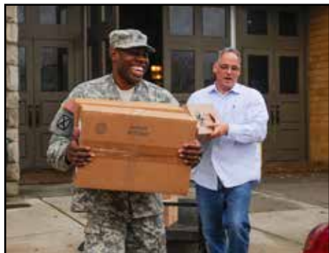
The Maryland National Guard's Partners in Care initiative donated 50 holiday meals to soldiers and Airmen for Thanksgiving. The meals were delivered to the Fifth Regiment Armory in Baltimore, Md., Nov. 24, 2014.