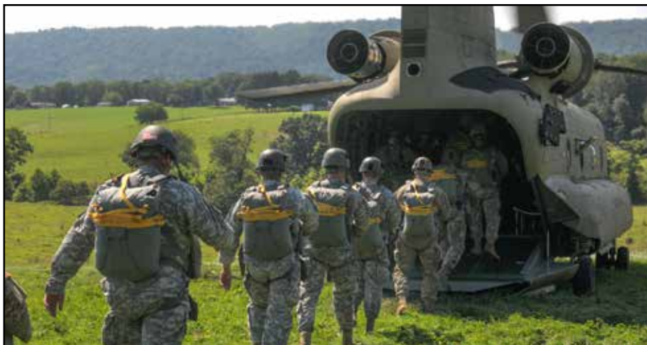
Soldiers with C Company (long-range surveillance), 1st Squadron, 158th Cavalry Regiment, Maryland Army National Guard, jump from a CH-47 Chinook on July 18, 2015, over Little Orleans, Maryland. The LRS unit, which is based out of Hagerstown, is scheduled to be disbanded in August. This was the unit's last jump.