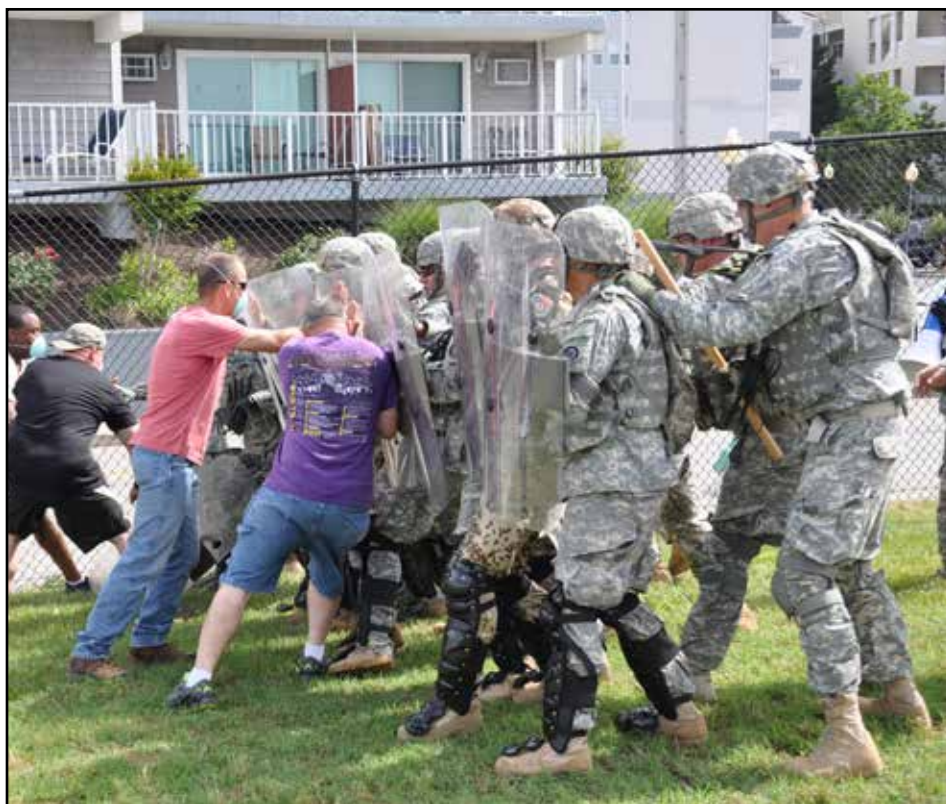
The Maryland Army National Guard trained with the U.S. Coast Guard in Ocean City, Md., to exercise the procedures of controlling riots, MEDEVAC with a Black Hawk helicopter, and to build future relationships as first responders, on June 16, 2015.

Continual improvement of the MDARNG will allow it to compete in Army Communities of Excellence competition.