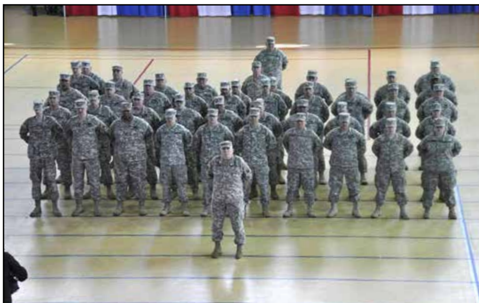
The Maryland Defense Force stands at ease in a formation at the 5th Regiment Army.

The MDDF band will begin its move from the Pikeville Military Reservation to the Miller Building at Camp Fretterd Military Reservation where they will continue the renovation of their new headquarters.