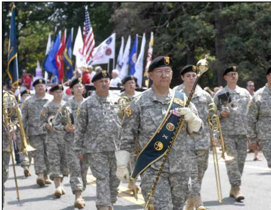
The Maryland Defense Force band marches in the Catonsville 4th of July Parade.

MDDF personnel provided support and technical expertise to the MDARNG on a recent chemical, biological, radiological, nuclear and explosives exercise.